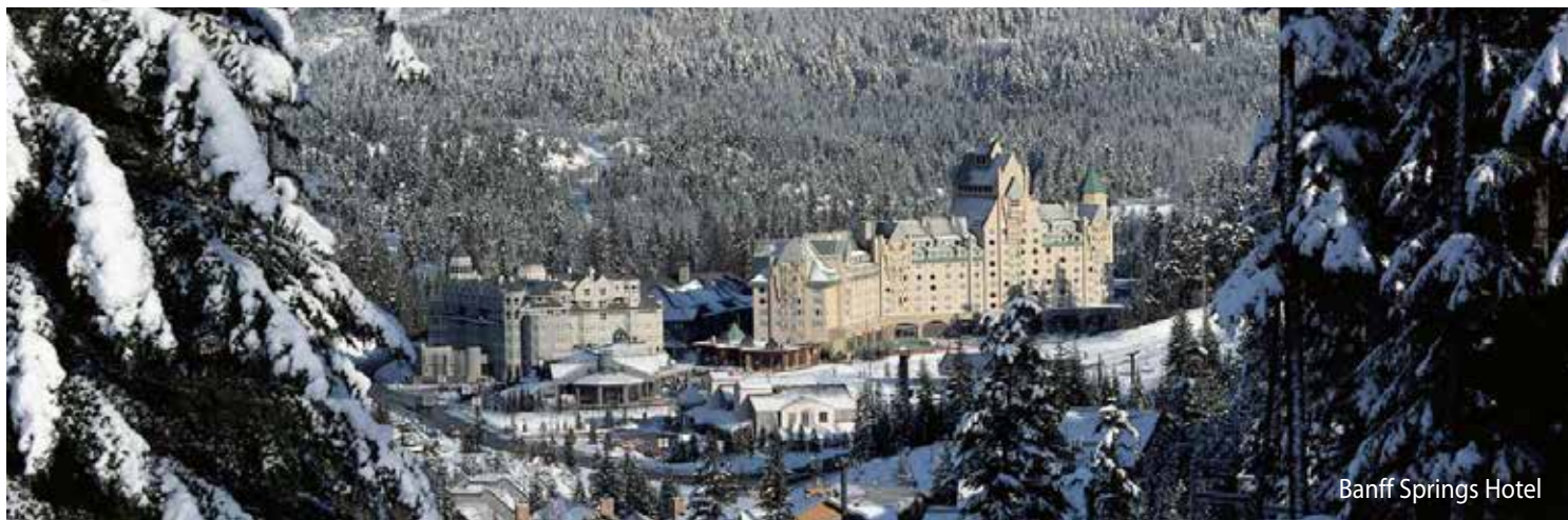
Banff Springs Hotel