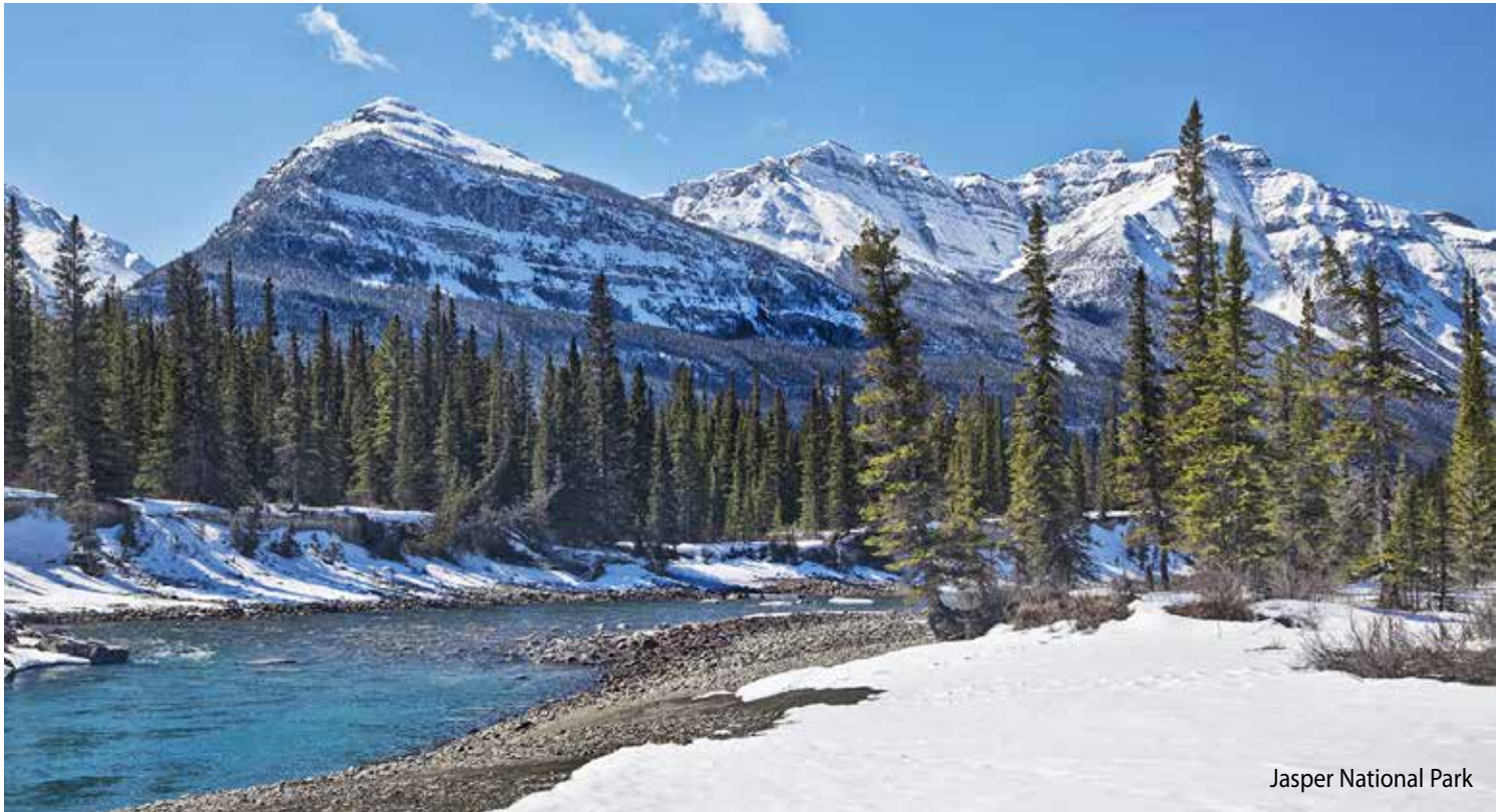
Jasper National Park

changes from flat lands back into forest and hills. Begin your climb into the cozy nestled town of Jasper. Arrival into Jasper early afternoon today with transfer service to your accommodation. This afternoon has free time to relax and get a feel for this quaint town considered the gateway to Jasper National Park and the Canadian Rockies. Overnight Jasper. Breakfast and lunch served in the dining car aboard VIA Rail.