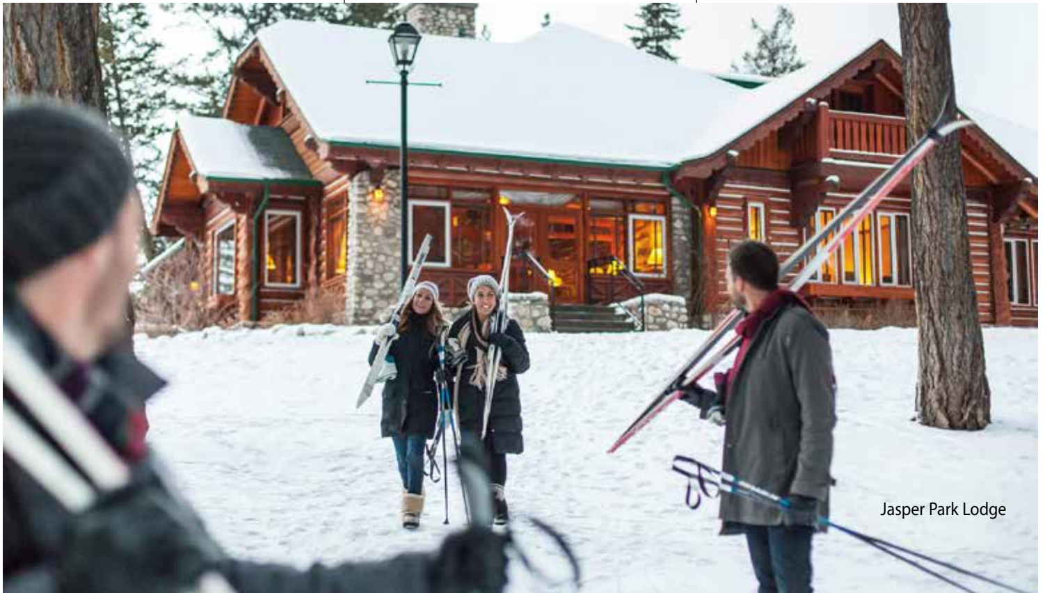
Jasper Park Lodge

clude. In the afternoon and evening you will have an opportunity to enjoy the lodge and all its amenities and perhaps a stroll around the grounds of the Lodge. Enjoy a quiet drink in the Emerald Lounge or enjoy the outdoor pool and hot tub. The day is yours. Overnight Fairmont Jasper Park Lodge ~ Continental Breakfast and brunch included.