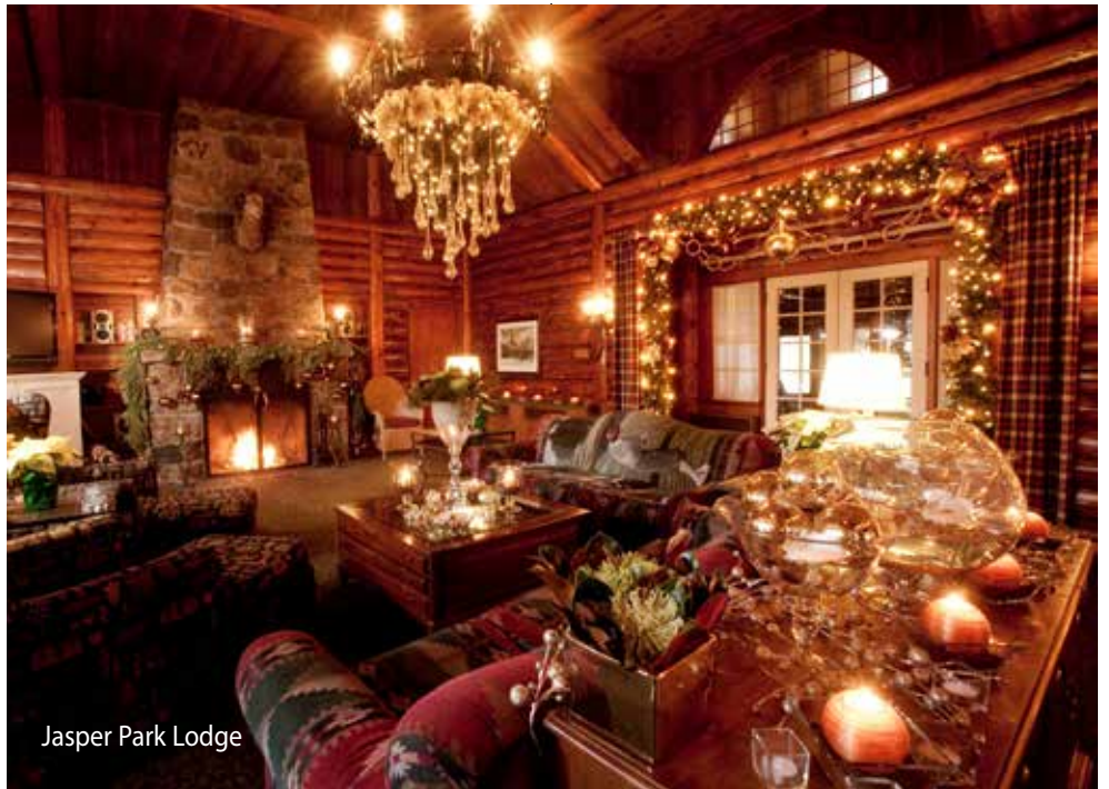
Jasper Park Lodge

This morning we will leave the big city and transfer through the Canadian Rocky Mountains Icefield Parkway to Jasper. En-route to Jasper enjoy the impressive views of the Canadian