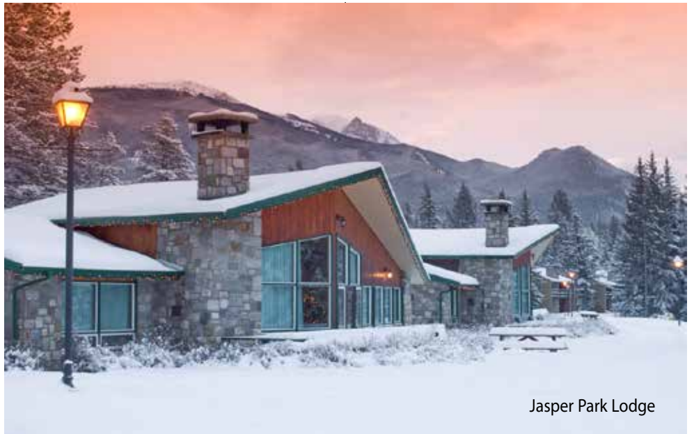
Jasper Park Lodge

How about attending a wine tasting today with some of the wine experts? Take a break and breathe in some fresh Rocky Mountain air on a special cottage tour aboard a horse drawn wagon. The Lodge’s original cottages (some dating back to 1928) are beautifully decorated for the holidays. Using garlands, bows, fresh greenery and thousands of twinkling lights, discover lots of super ideas for decorating your home. A reception