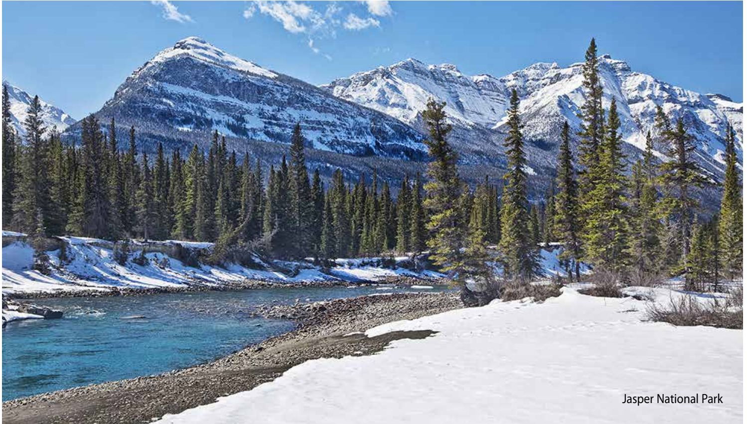
Jasper National Park