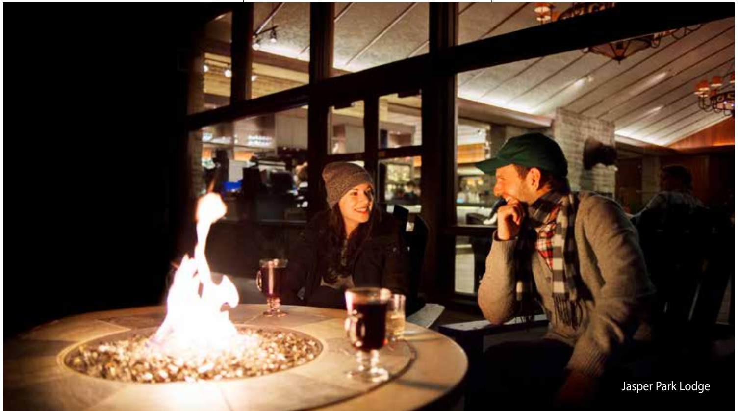
Jasper Park Lodge

the holiday season! Transfer to the Lodge and the celebrations will begin with a Welcome Stand-up Dinner Reception in the seasonally decorated Great Hall of the Lodge. Overnight Fairmont Jasper Park Lodge ~ Box lunch & Welcome Stand Up Dinner Reception at the hotel included.