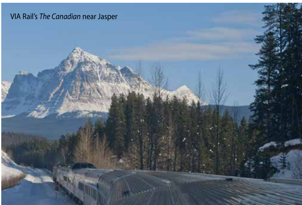
VIA Rail's The Canadian near Jasper