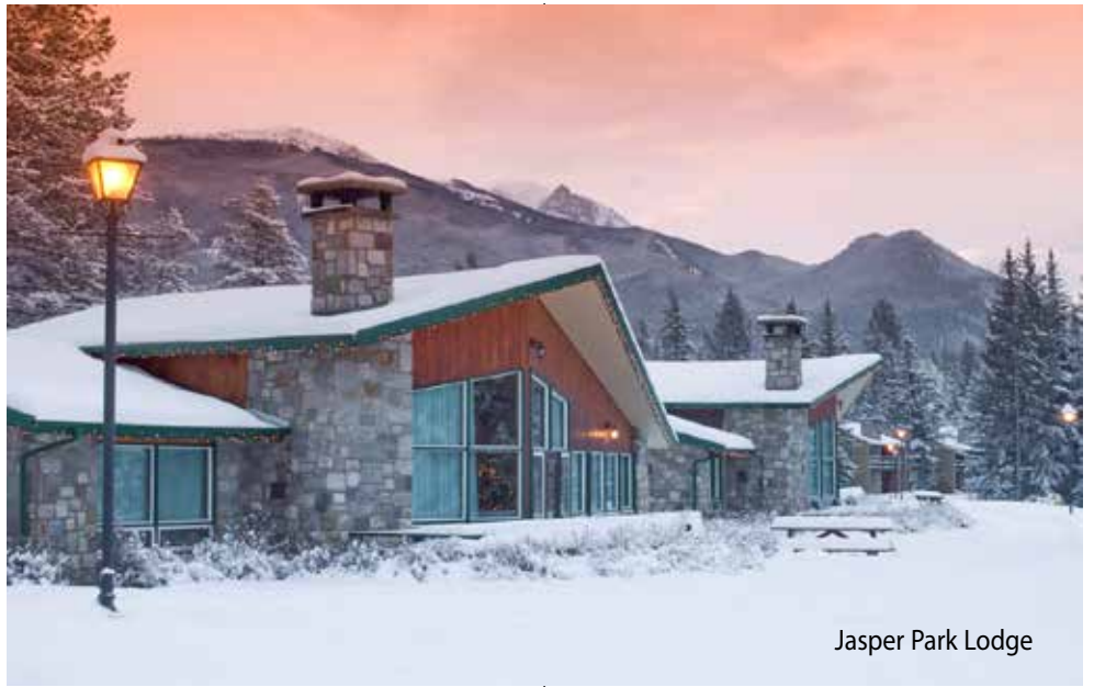
Jasper Park Lodge

Today enjoy a journey along the Icefields Parkway traveling from Jasper to Lake Louise. Your morning transfer provides a great view of the passing mountains, and wildlife can be seen in the distance as you make your way south to gorgeous Lake Louise. Stay at the world renowned Fairmont Chateau Lake Louise and enjoy spectacular views from your Lake View room. Enjoy a variety of choices for dining this evening in any one of five dif-