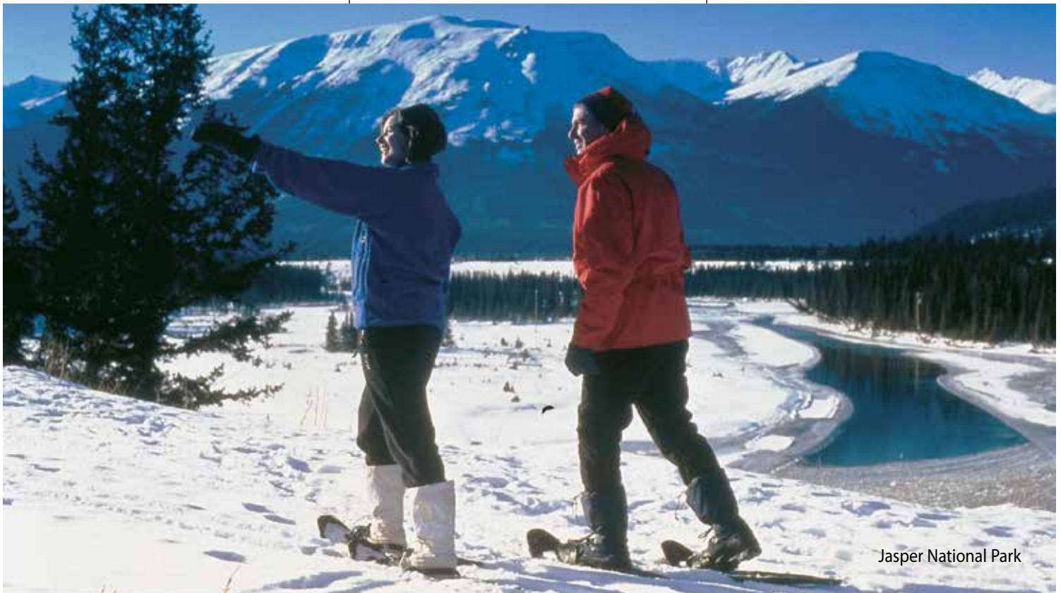
Jasper National Park

watch for wildlife and magnificent Mt. Robson, the highest peak in the Canadian range. Arrive mid-afternoon at Jasper, nestled in the heart of Jasper National Park, and transfer to the Fairmont Jasper Park Lodge with time for exploring the charming town, taking part in one of the many outdoor activities, or just relax by the roaring fire.