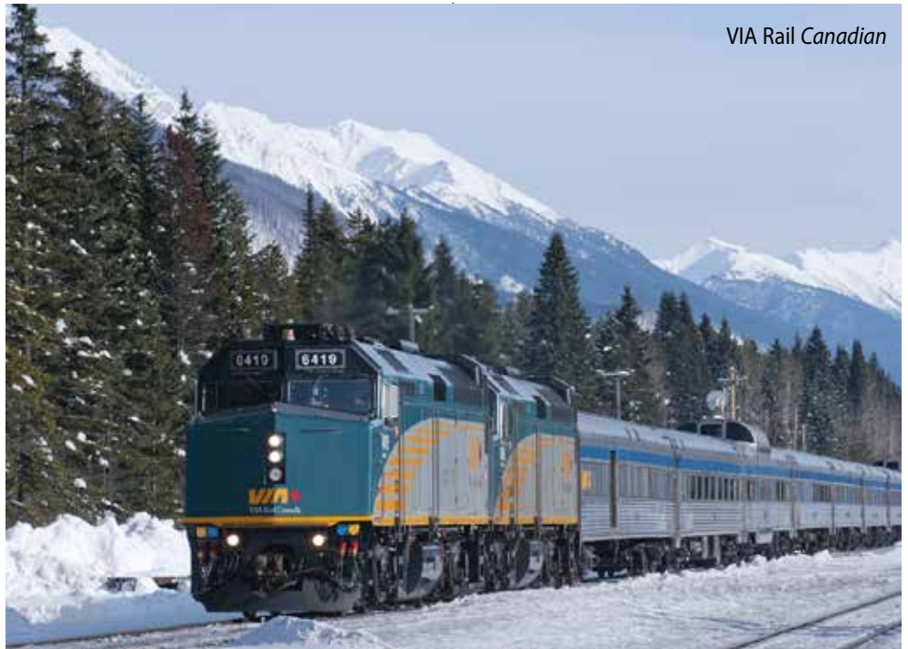
VIA Rail Canadian

Arrive into Pacific Central Station for an early evening departure aboard VIA Rail’s train Canadian , in Sleeper Plus Class accommodations. Relax in your sleeper car accommodations or enjoy the ambiance of the