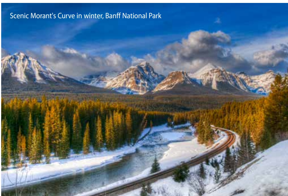
Scenic Morant's Curve in winter, Banff National Park

hot waters all whilst savoring the spectacular alpine view. Overnight Fairmont Banff Springs Hotel.