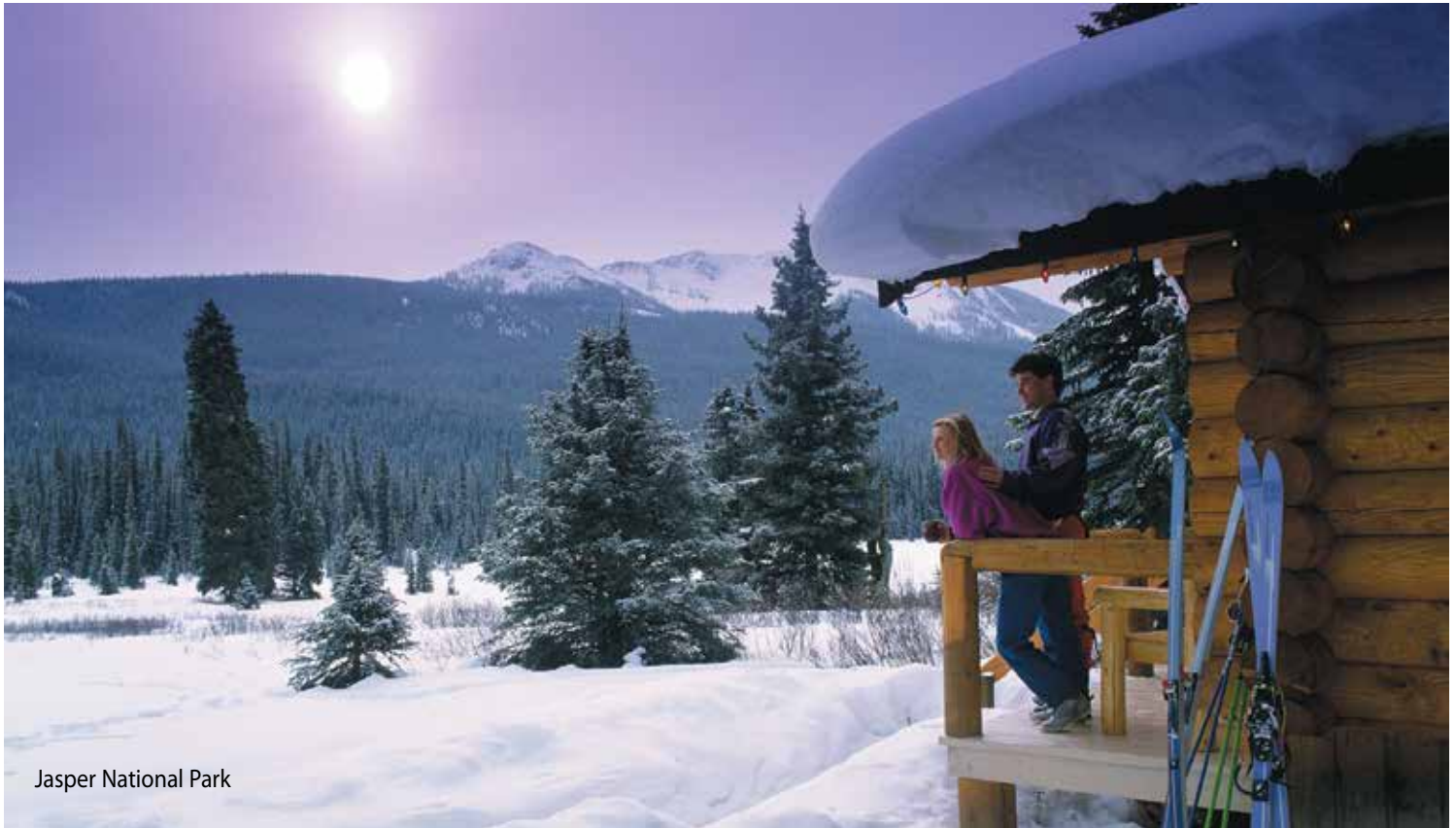
Jasper National Park